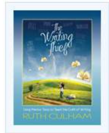
The Writing Thief: Using Mentor Texts to Teach the Craft of Writing (Ruth Culham)